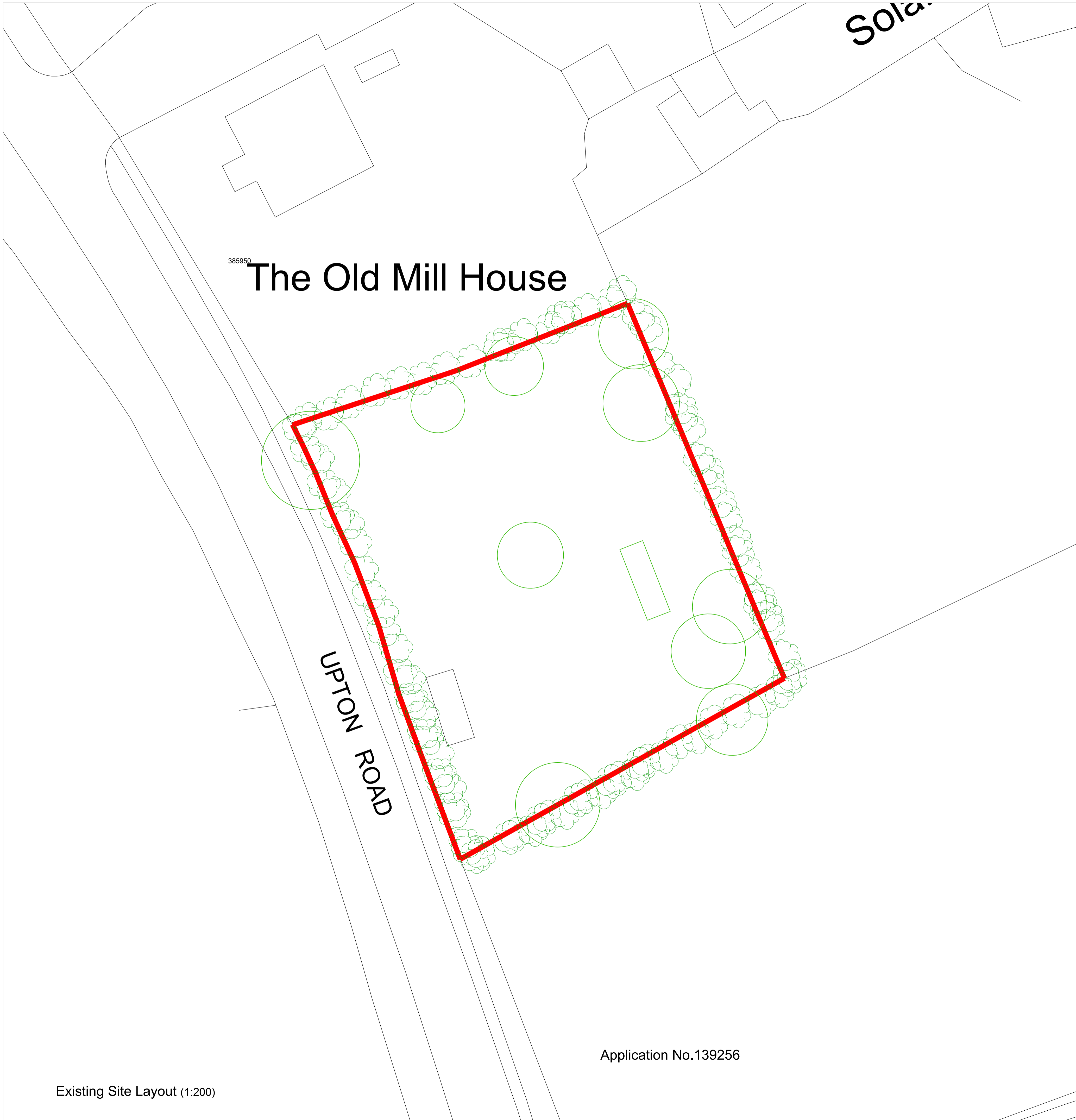
Existing Site Layout (1:200)

General Notes: This drawing is to be read in-conjunction with all other relevant drawings and specifications. Should any discrepancies between the details/dimensions indicated on this and/or any other relevant drawings Designsace Architecture Ltd must be notified immediately.